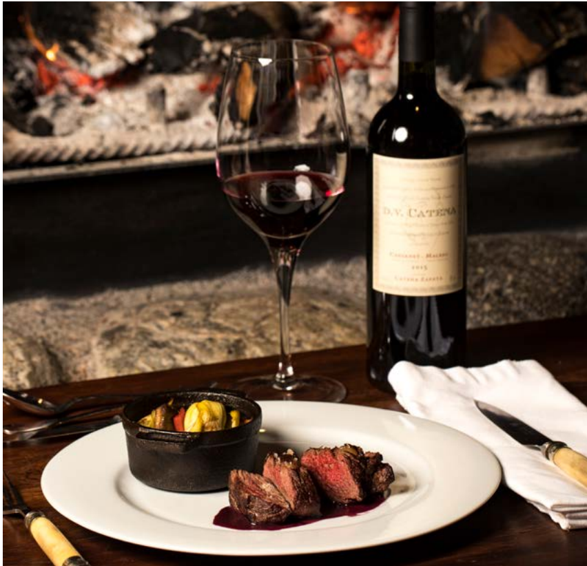
Our menus are paired with some of the world's best wines.