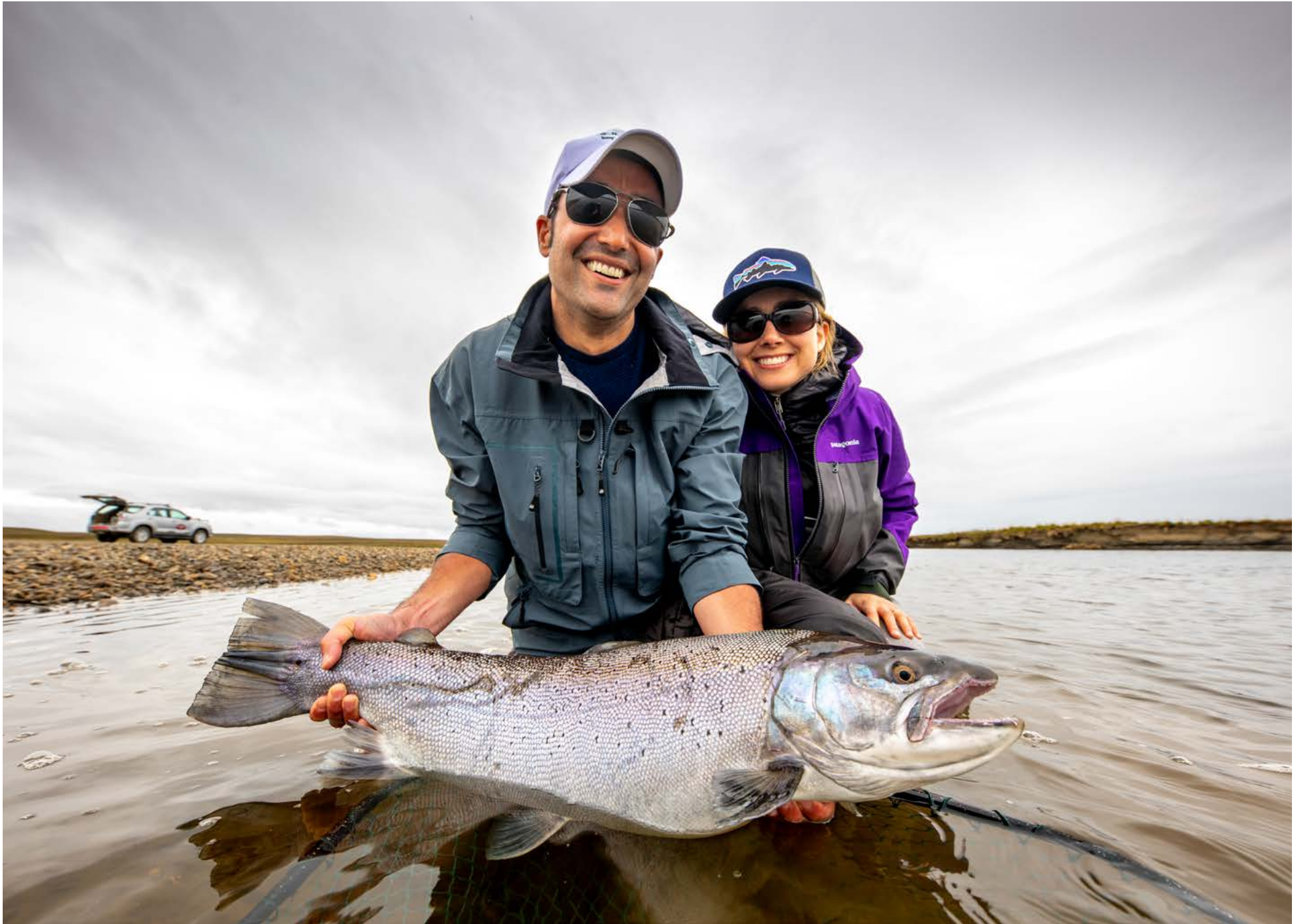
At Kau Tapen we fish for Sea-Run Brown Trout weighing an average of 7 lbs and ascending to 30lbs and above.