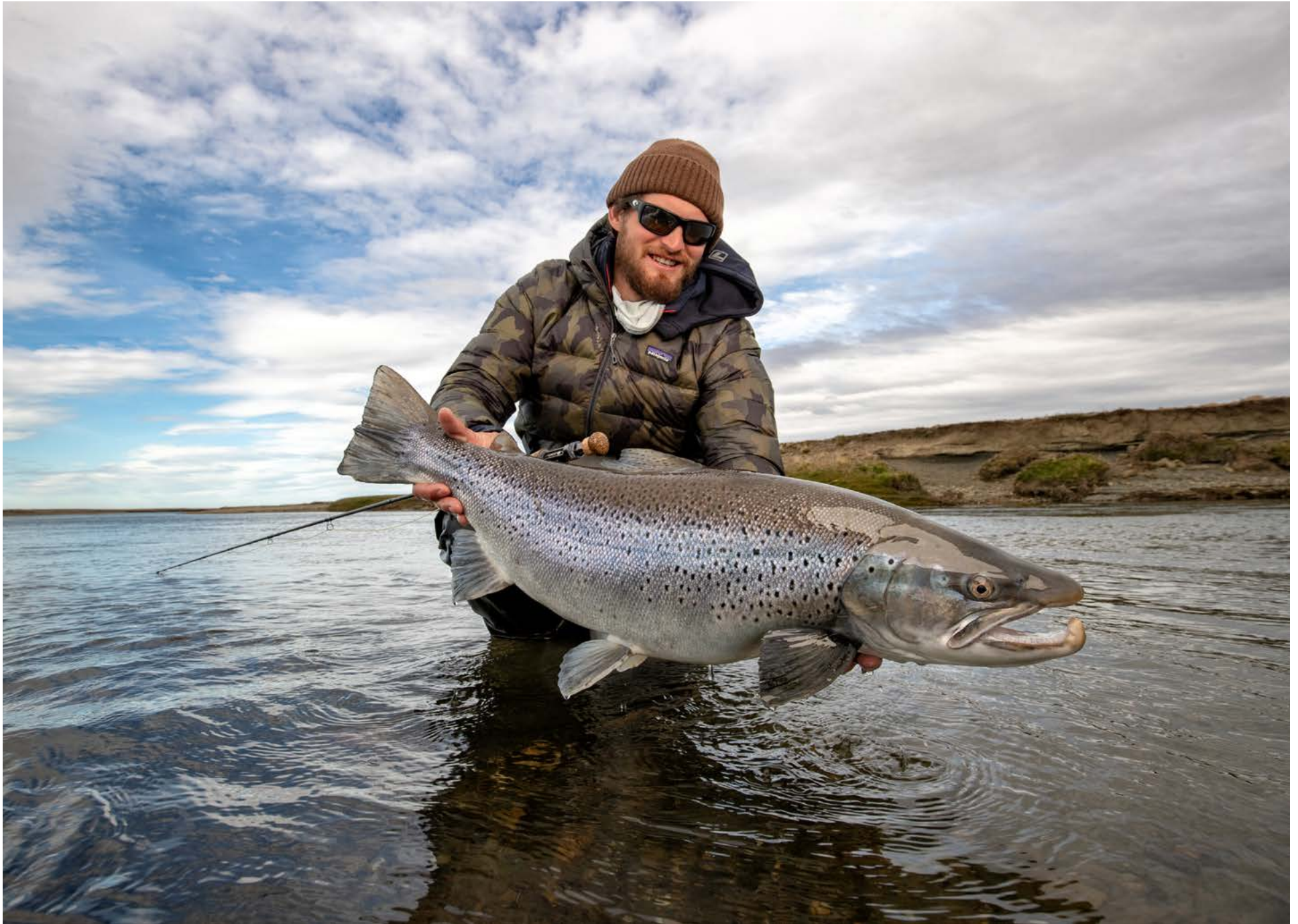
In the heart of the Río Grande watershed, lie the best pools on the river, and the finest fish.