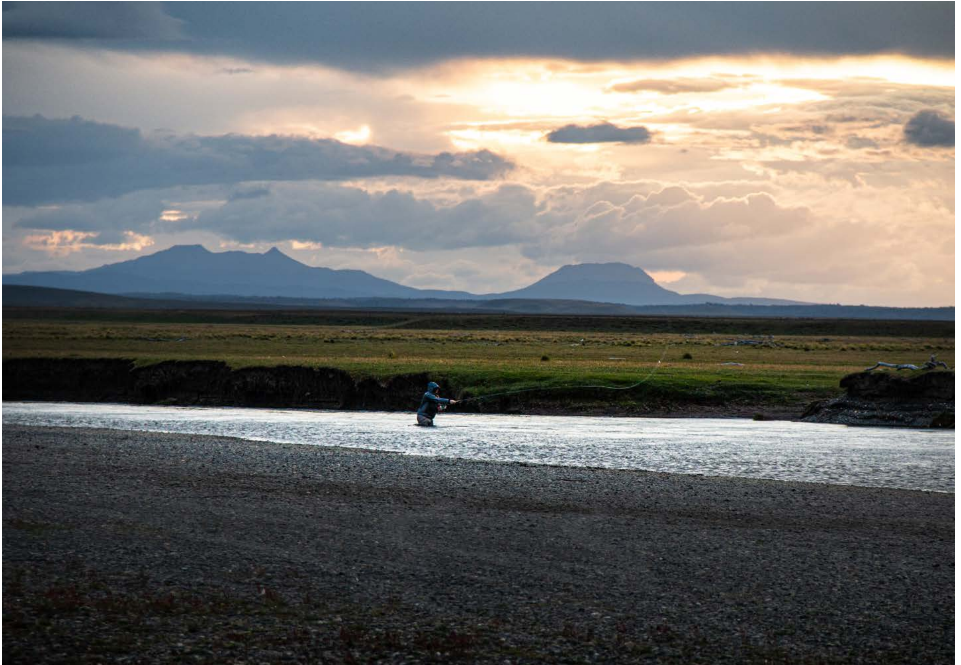
The landscape of Tierra del Fuego is reminiscent of Wyoming or the Scottish low country. It includes sparsely populated wilderness, large sheep farming estancias, and wild herds of llama-like Guanacos, as well as plentiful fox and condor populations.