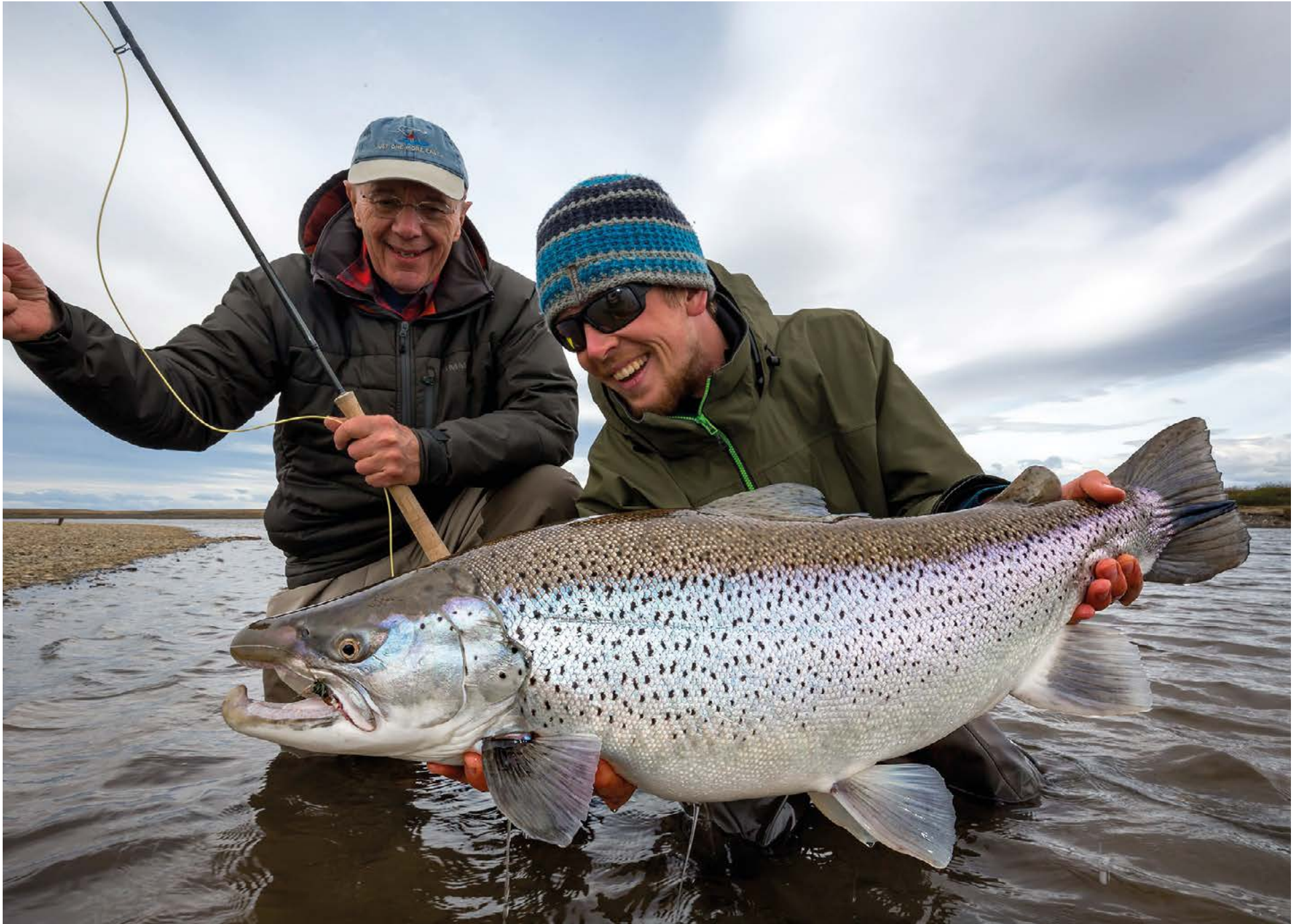
The Rio Grande has become the most productive sea-run brown trout fishery in the world.