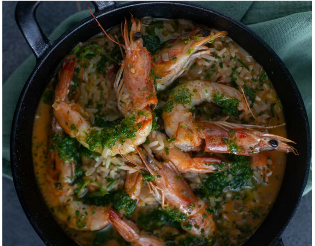
Soupy Rice with Patagonian Prawns.