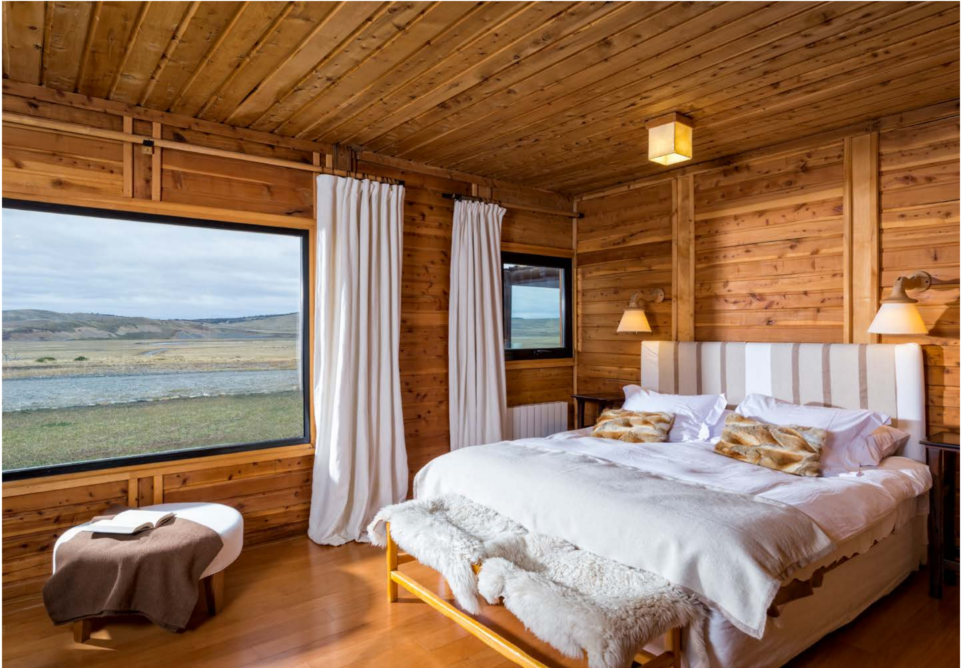
Kau Tapen has 10 en suite single rooms; some offer a king bed, some have one queen, and others are furnished with two doubles.